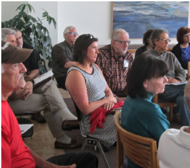
From the May ZAP Meeting