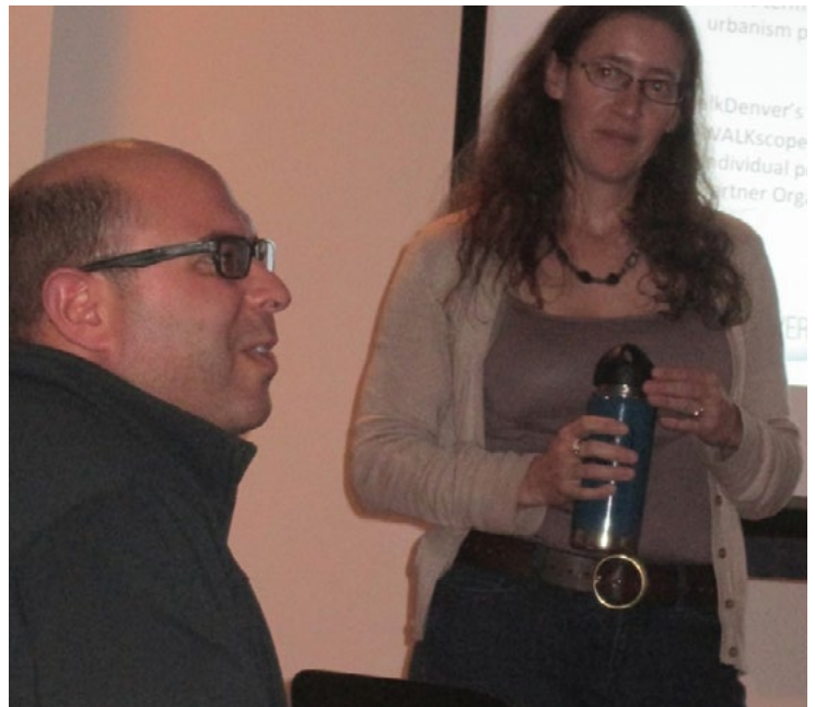
Walk Denver Presentation at the May Transportation Meeting