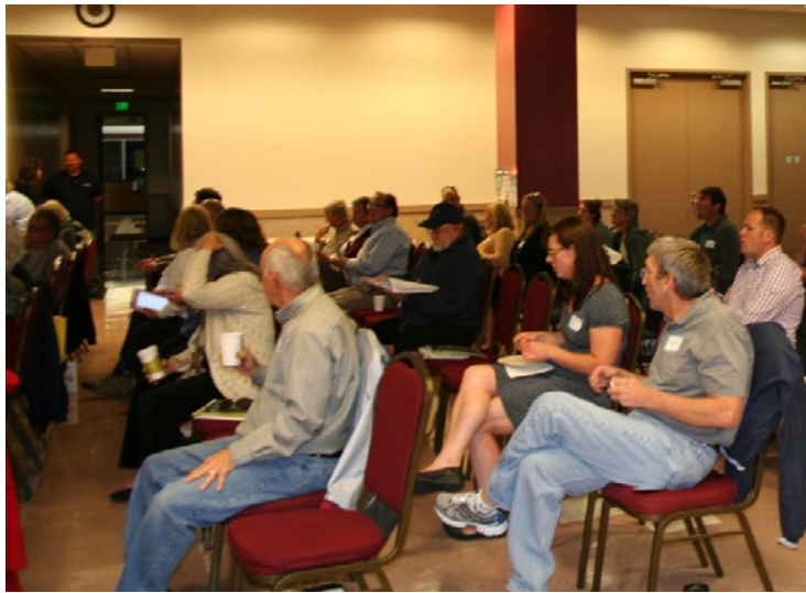
INC May Delegate Meeting