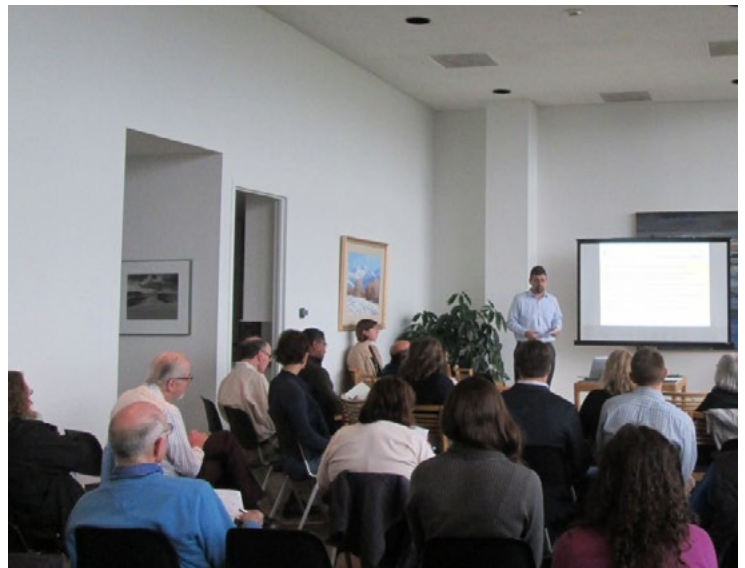
From the May Transportation Meeting