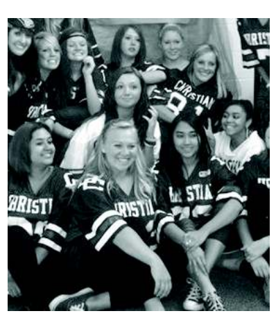
Senior girls ready for the Homecoming Powder Puff football game.

Denver Christian High School has developed a reputation throughout the Colorado educational circles as having high academic standards (with 94% of our graduates going on to four-year colleges or universities at places as different