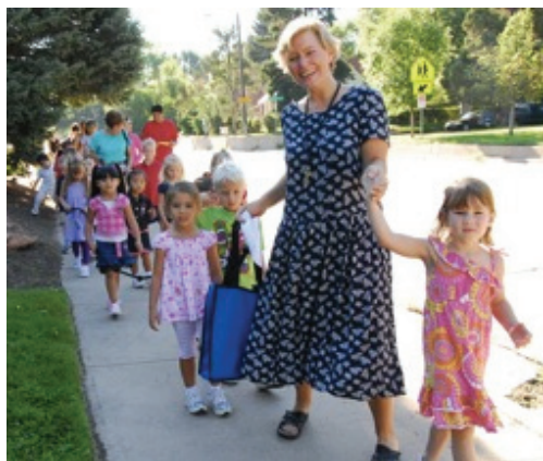
Pre-school Prayer Walk