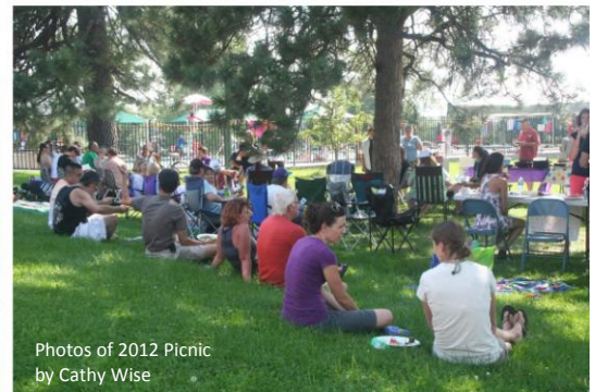
Photos of 2012 Picnic