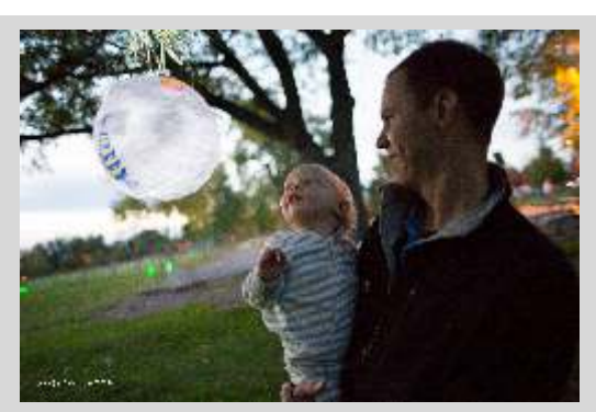
Lanterns were made by local kids, board members