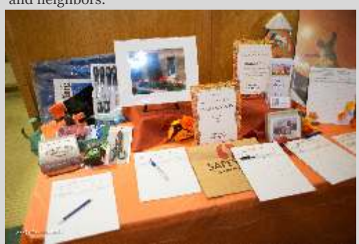
Silent auction items were donated by local businesses. Proceeds benefited Urban Peak.